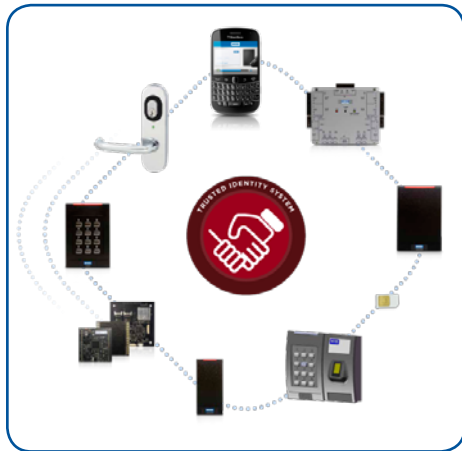
iCLASS SE® Platform